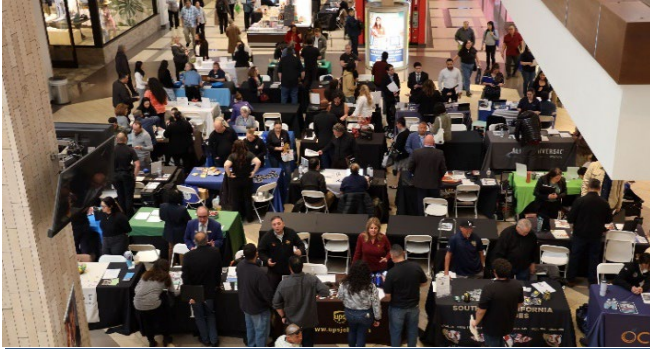
Career Fair - Brea January 30, 2025