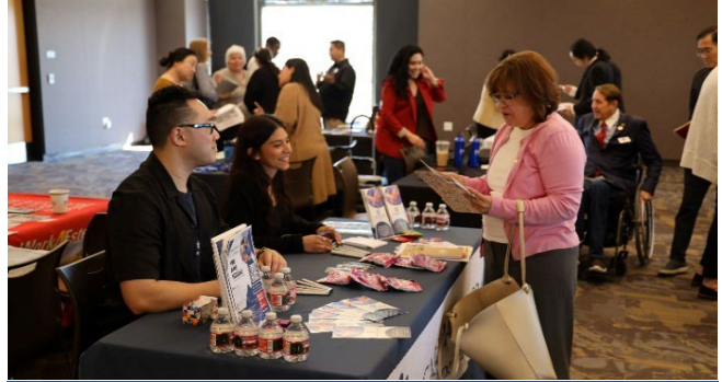
Career Fair - Lake Forest February 20, 2025

The OC Workforce & Economic Development Division (WEDD) kicked off the year with two impactful Career Fairs, connecting hundreds of job seekers with local employers.